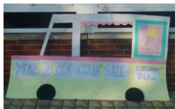
Ice cream mania!