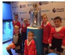
Barclaycard football competition