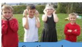
Creating and making earmuffs