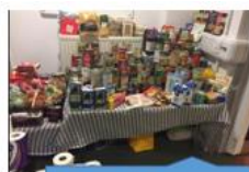
Generous Harvest Contributions